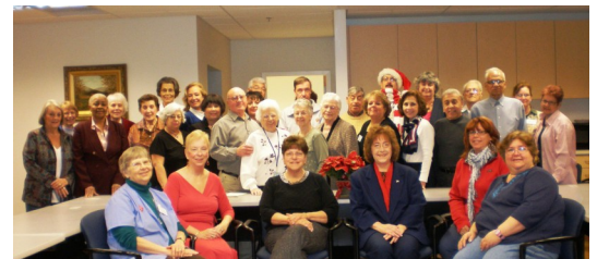
The Staff at the Milford Senior Center wishes everyone a safe and happy holiday